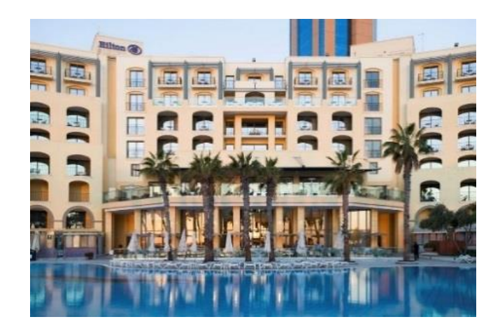
THE HILTON HOTEL

Students from 18 years old will be required to pay an Environmental Contribution amounting to \leq 0.50c per night up to a maximum of \leq 5 for each continuous stay in the Maltese Islands.