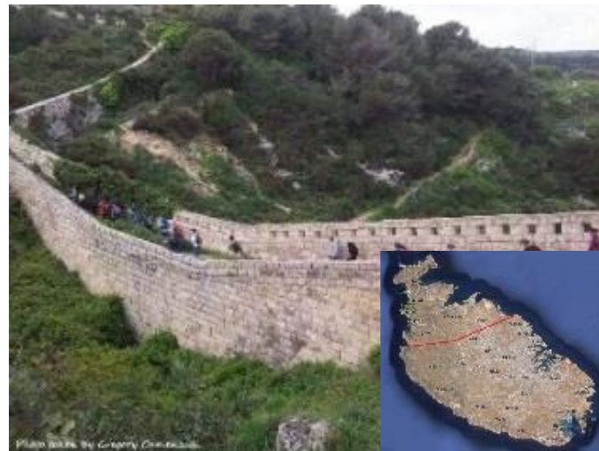
Victoria Lines Challenge Hike!