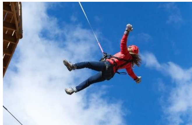
SKY WALK with 20m FREE FALL JUMP!