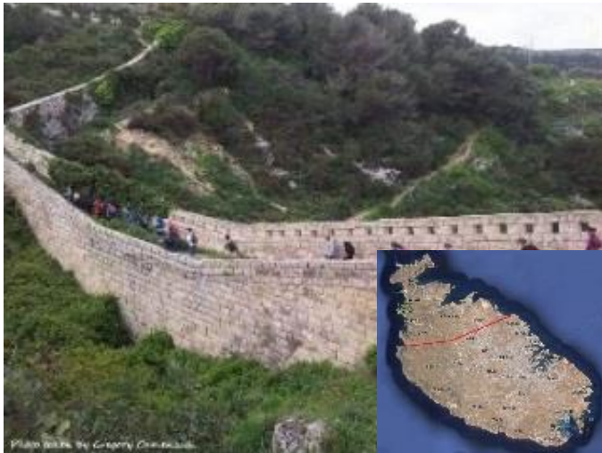
Victoria Lines Challenge Hike!