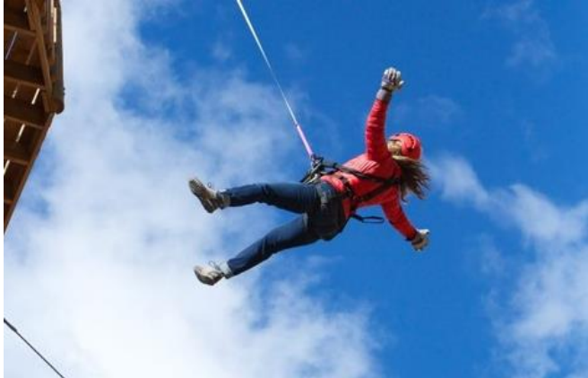
SKY WALK with 20m FREE FALL JUMP!