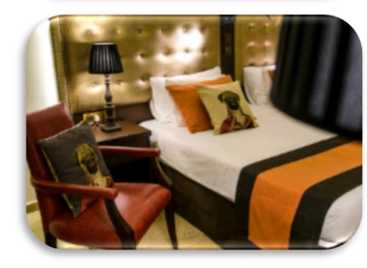
Check -in: 15.00 Check-out: 12.00 Heating equipment and a/c in rooms Bed type: orthopaedic Bathroom facilities: hairdryer & socket for European plugs